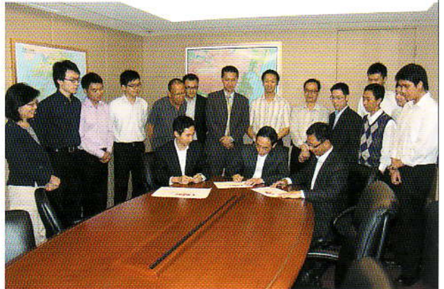
The project team signed the acceptance tests on 13 May